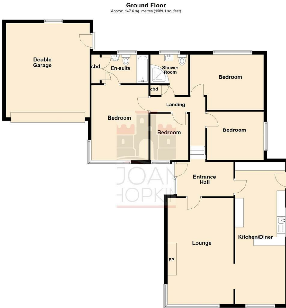
Total area: approx. 147.6 sq. metres (1589.1 sq. feet)